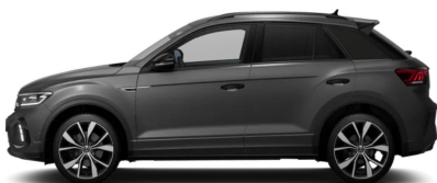
Indium Grey Matte 9709

Please note, the print processes do not allow exact reproduction of the paint colours.