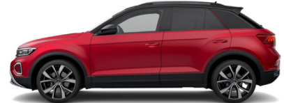
Kings Red Metallic Black Roof P8P8 P8A1