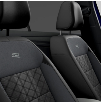
"Lava Stone Black" R-Line cloth Flint Grey/Black (OC) Standard on R-Line Models