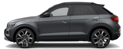
Indium Grey Metallic Black Roof White Roof X3X3 X3A1 X30Q