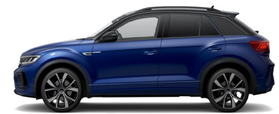
Lapiz Blue Metallic Black Roof L9L9 L9A1