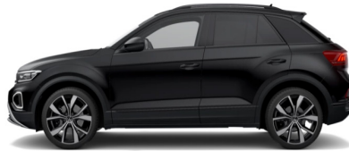
Deep Black Pearl Effect White Roof 2T2T 2T0Q 2TX3