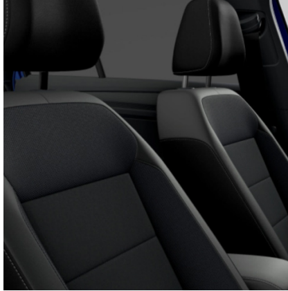
"Deep Iron Grey" ArtVelours cloth Titan Black (FX) Standard on Style