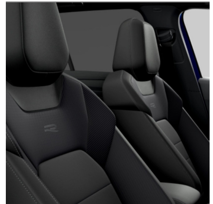
"Nappa Carbon Style" leather Black/Carbon (EM) Optional on R-Line