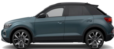
Petroleum Blue Metallic Black Roof Z3Z3 Z3A1