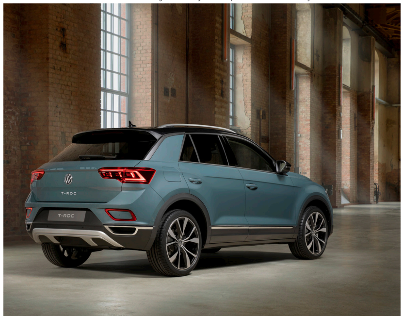
Note: The above image shows Style with optional 19" Misano Alloys

The above specifications are for information purposes only as our products are continually updated and changes may be made to the specifications at any time. If you require any specific feature, you must consult your local dealer who is regularly updated with any change in specification. Specifications are subject to change without notice.