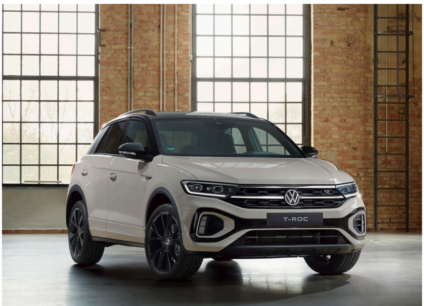
Note: The above Images shows optional 19" Misano Alloys in Black

The above specifications are for information purposes only as our products are continually updated and changes may be made to the specifications at any time. If you require any specific feature, you must consult your local dealer who is regularly updated with any change in specification. Specifications are subject to change without notice.