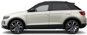
Ascot Grey Solid Black Roof White Roof 6U6U 6UA1 6U0Q