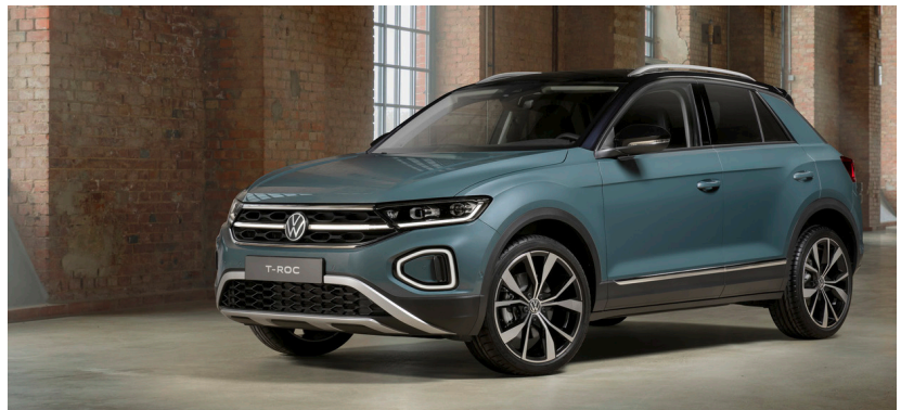
Note: The above image shows Style with optional 19" Misano Alloys