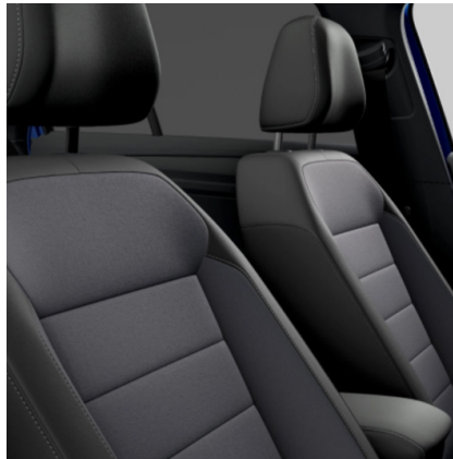
"Vienna" leather Platinum Grey/Black (LE) Optional on Style