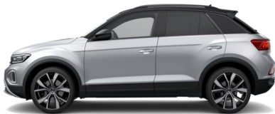
Pyrite Silver Metallic Black Roof White Roof K2K2 K2A1 K20Q