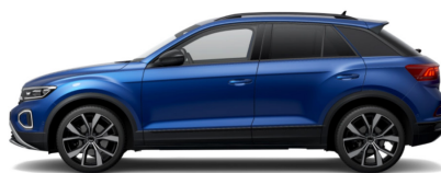
Ravenna Blue Metallic Black Roof White Roof 5Z5Z 5ZA1 5Z0Q