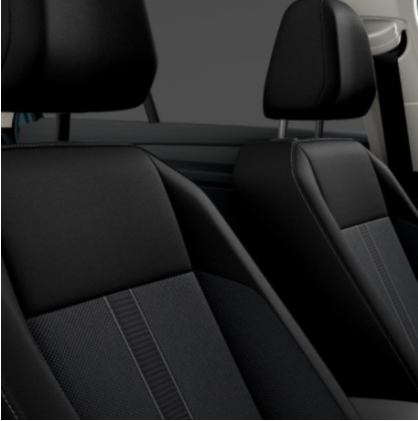
"Pewter Matte" cloth Titan Black/Ceramique (FJ) Standard on Life and Edition 75