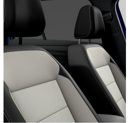
"Deep Iron Grey" ArtVelours cloth Storm Grey (XI) Standard on Style