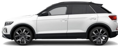
Pure White Solid Black Roof Grey Roof 0Q0Q 0QA1 0QX3